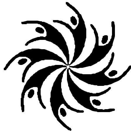
Logo of the 4 th Women's NGO (Non Governmental Organization) Conference on Women in Beijing, China, 1995.

Finally, we believe that because of changes in status, work, and responsibilities, a woman must have access to leadership training and mentoring from